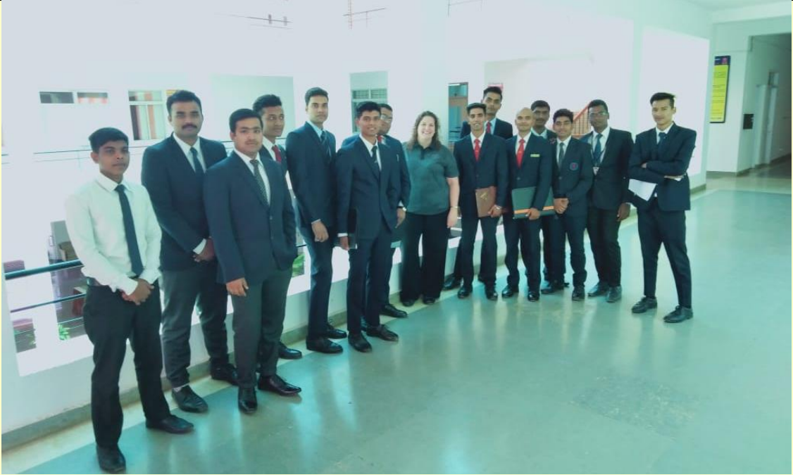
Hyatt Regency USA team conducted interview on 11 Jan 2019